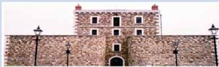
A portrait of a castle, designed by the Wicklow Heritage Forum.